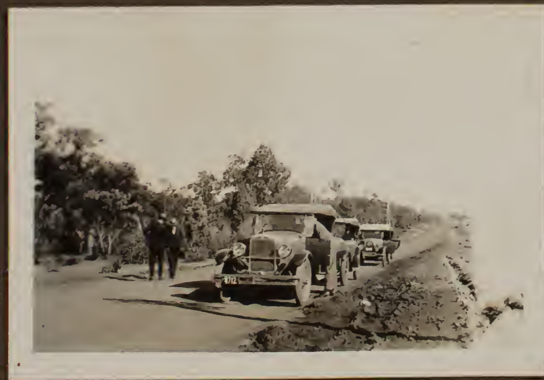
Point N.A. 25. 11. 28